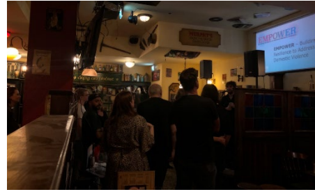
Multiplier event in Germany