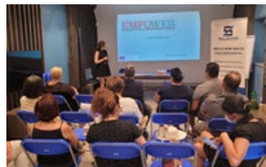
Piloting in Malta