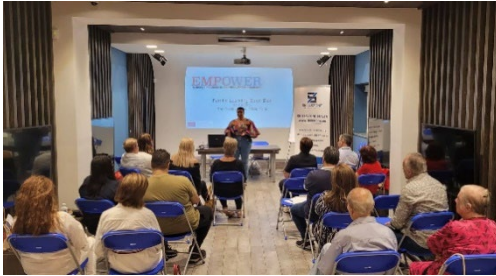
Multiplier event in Malta

We are sharing some moments from multiplier events below.