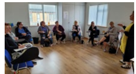
Piloting in United Kingdom