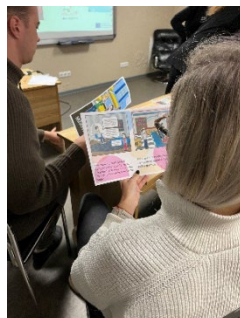
Piloting in Lithuania