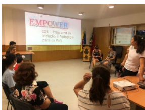
Piloting in Portugal

All the partners successfully organized piloting events of all four intellectual outputs. Some of the events were held face to face while other had to be done online. We received very positive and constructive feedback. Below you can see a few pictures from the piloting events in partner countries.